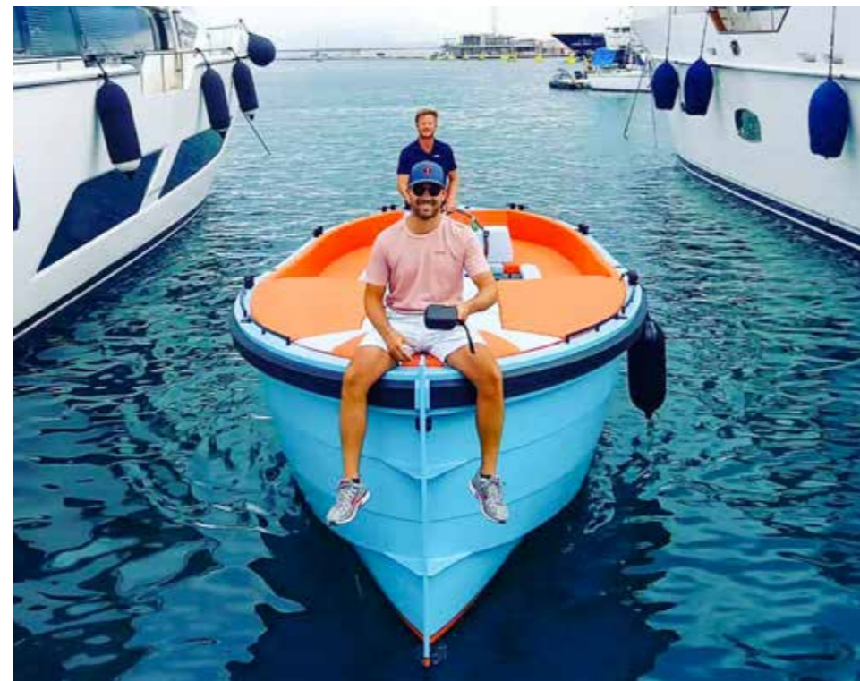
LEKKER Damsko 750